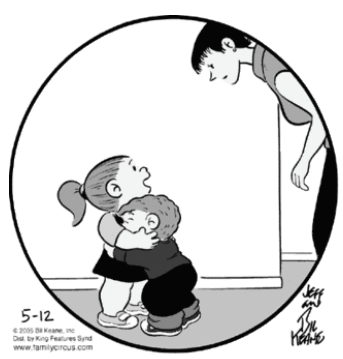
"Look, Mommy! We're pretending to love each other."